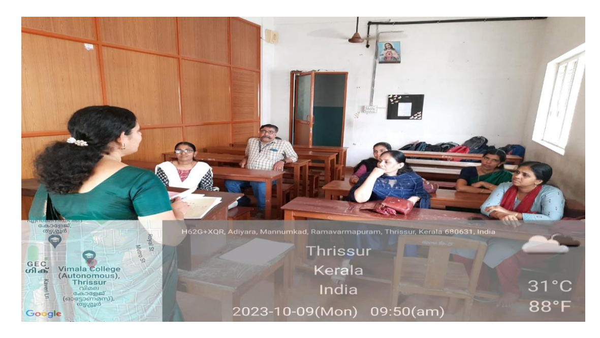
Department PTA meeting of PG students was held on 9<sup>th</sup> October 202.

• Department PTA meeting of S5 UG students was held on 9<sup>th</sup> October 2023.